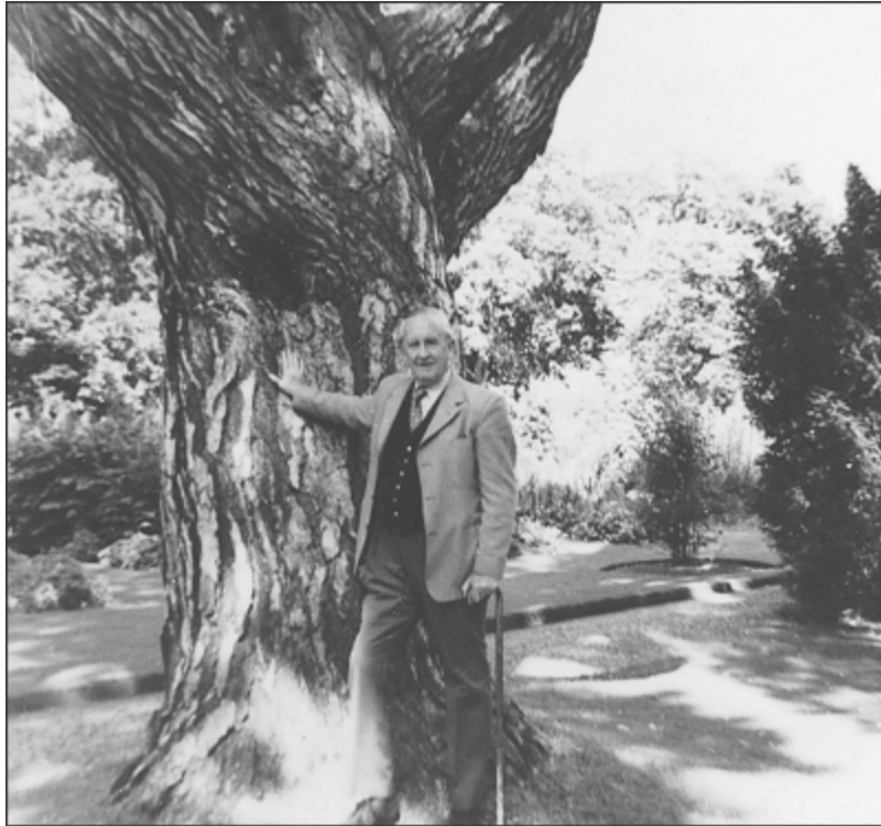
The last photograph of Tolkien, taken on 9 August 1973 next to one of his favourite trees ( Pinus Nigra) in the Botanic Gardens, Oxford

A page from the manuscript of The Lord of the Rings (by permission of Marquette University, Milwaukee).