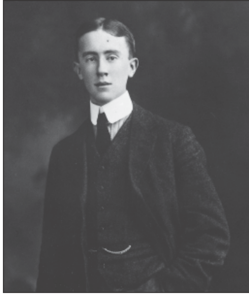
Ronald Tolkien in 1911, aged nineteen.