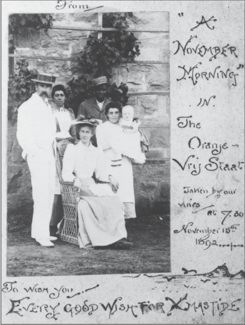
Family group, Bloemfontein, November 1892