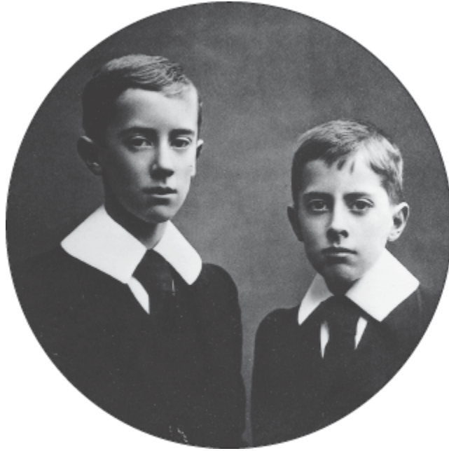
Ronald and Hilary Tolkien in May 1905.